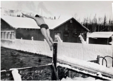
▲ Soldier diving into the hot springs, 1950s.