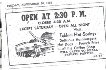
▲ Whitehorse Star, Friday November 26, 1954.