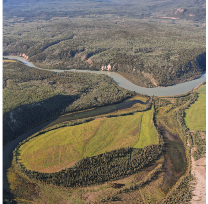
▲ Aerial view of Old John's Slough.

According to some Elders, Takhini Hot Springs was considered a sacred place, similar to the hot springs in the McArthur Wildlife Preserve near Pelly Crossing. People respected the hot springs and left the area in its pristine state after their visits. An Elder who lived in the vicinity of Takhini hot springs said that the hot springs was a sacred place and that it was forbidden to hunt there. The hunters would only come to hunt at the hot springs in times of scarcity. The area was known to have lots of wildlife, and it was used as a food reserve in times of starvation. In fact, hot springs all over the world are well known for attracting wildlife.