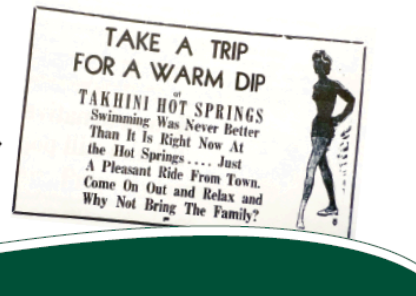
Whitehorse Star, September 26, 1957. ▶