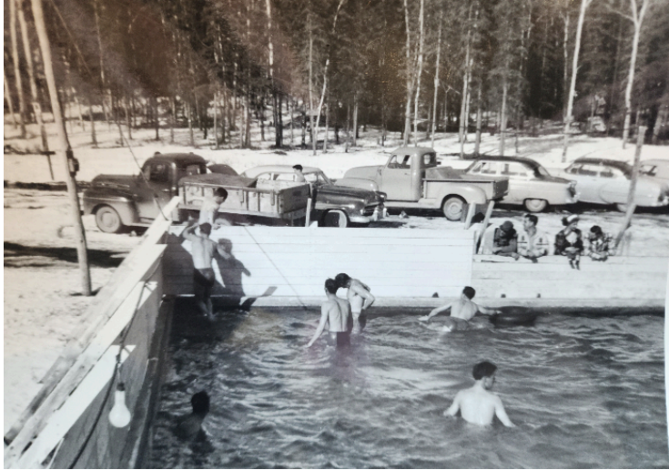
Photo of pool and cars in the parking lot, 1950s. ↓