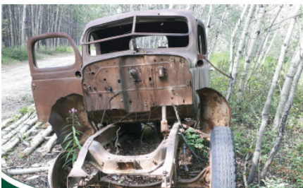
◀ Old truck on the property.