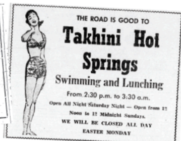
▲ Whitehorse Star, Thursday March 22, 1956.