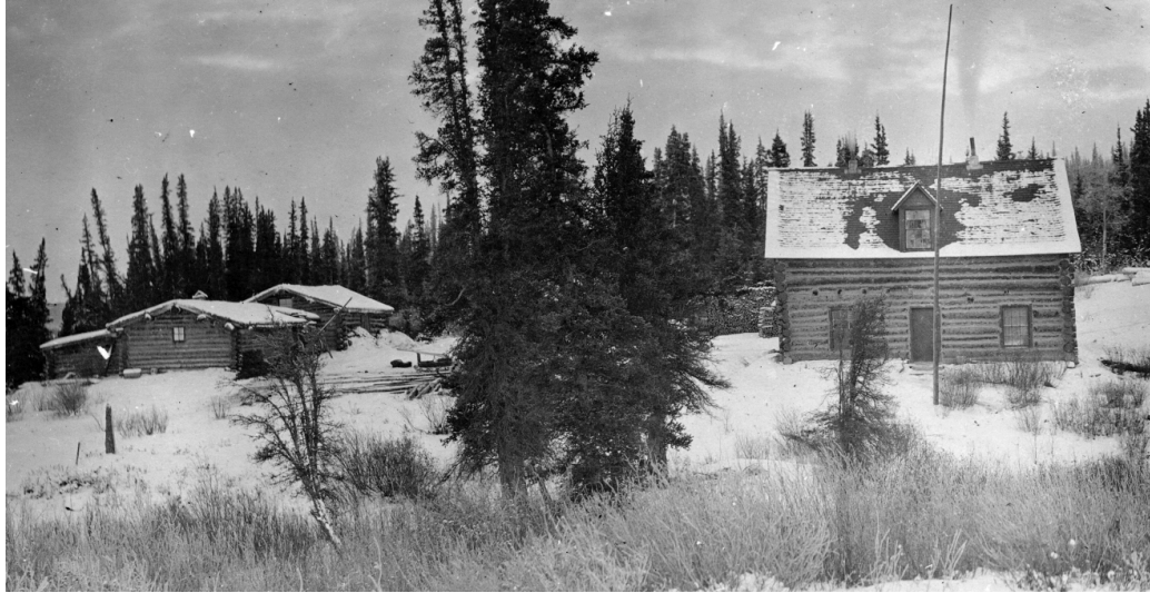
↑ 1922 photo of the police headquarters (Left) and the roadhouse (Right).

The roadhouse was a popular place for parties. Groups would come from Whitehorse, spend the night, and travel back home the next day.